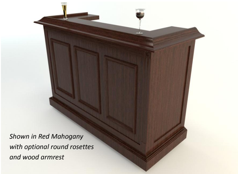
Shown in Red Mahogany with optional round rosettes and wood armrest

FOR EXCELLENT LEAD TIMES AND SUPERIOR CUSTOMER SERVICE, GENEVA IS UNRIVALED