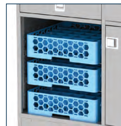
Open compartment option (door removed)