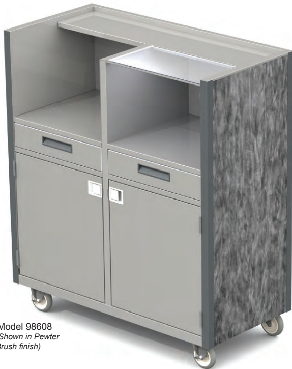
Model 98608 (Shown in Pewter Brush finish)