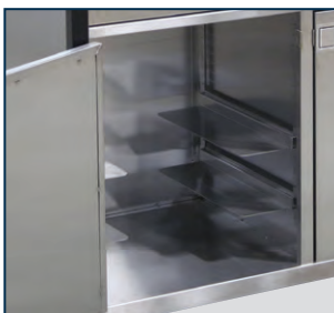
Lower compartments with adjustable ledges.