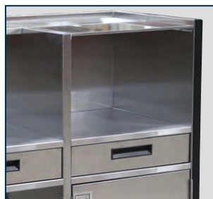
Compartment for touchscreen terminal has clear top shield for protection from elements.