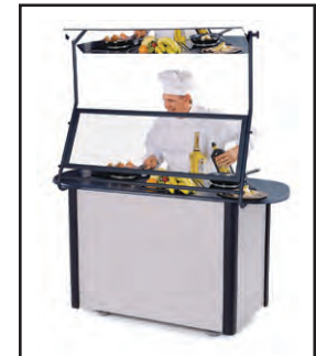
Optional food shield and demo mirror

Measurements in ( ) denote metric millimeters, unless otherwise specified. OA height with food shield is 57 1/2" (1461); OA height with demo mirror is 78 1/4" (2000).