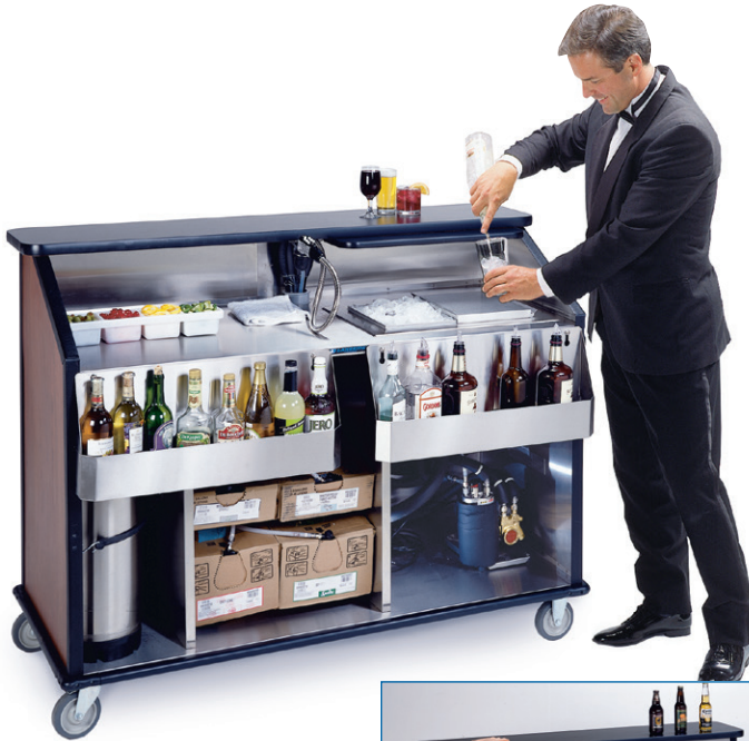
Model 76889 shown with optional Post-Mix dispensing system and optional Bag-in Box rack kit.